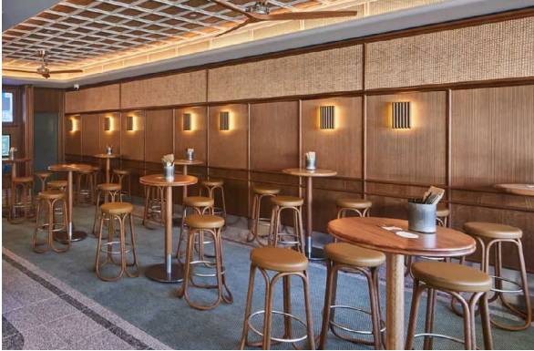
SPORTS BAR 50px