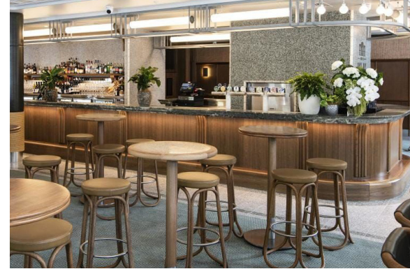
FRONT BAR 50px